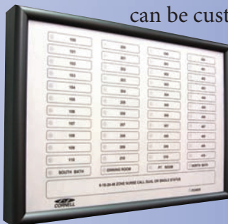
Standard 4448 Series Panel

This panel, used with the Cornell Series 4000 Visual Call System, permits central and remote monitoring of individual rooms/zones. The A-4448 annunciator panel allows for displaying 1 to 48 zones which can be custom labeled via software.