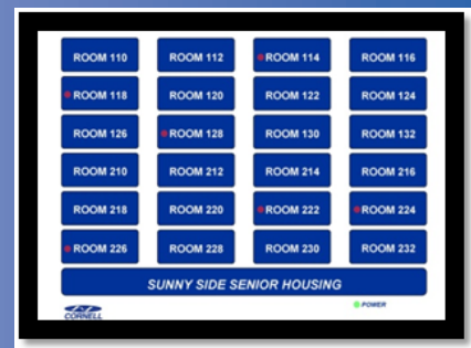
Customized 4448 Series Panel

If you want the flexibility of wireless (i.e. pendants) & wired call stations consider this option.